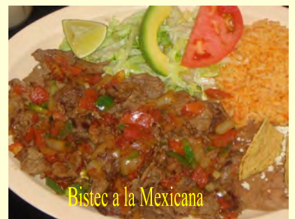
Bistec a la Mexicana