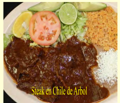
Steak en Chile de Arbol