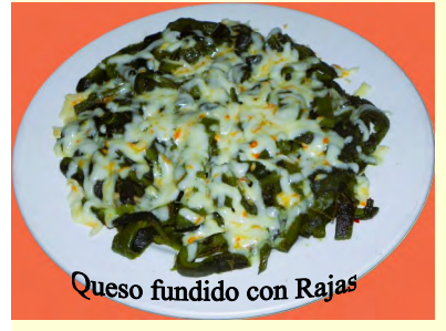
Queso fundido con Rajas

Corn chips topped with beans and melted cheese. Served with lettuce, diced tomato, guacamole and sour cream on the side.