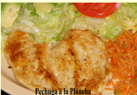
Pechuga a la Plancha

PECHUGA ASADA con ESPINACAS $14.50 Grilled tender chicken breast with spinach. Topped with melted cheese and served with rice, salad and tortillas.