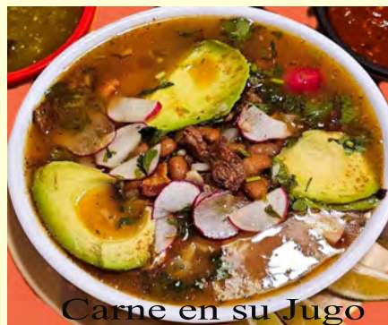
Carne en su Jugo