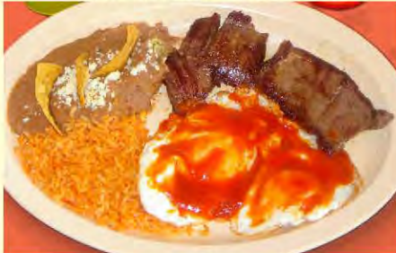
Huevos con Carne Asada

HUEVOS A LA MEXICANA $10.50 Scrambled eggs with diced tomatoes, onions & peppers.