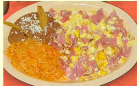
Huevos con Jamon

HUEVOS con JAMON $10.50 Scrambled eggs with ham.