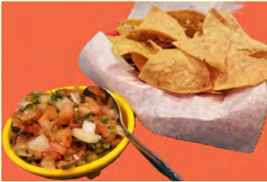
Pico de Gallo and Chips $1.50