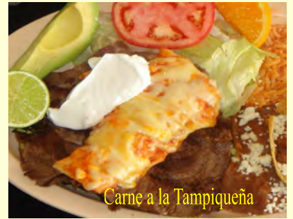
Carne a la Tampiqueña

CARNE EN SU JUGO (Meat in its juices) Mexican Beef soup with pinto beans, crispy bacon, steak simmered in our tomatillo sauce and topped with onion, cilantro, avocado and red radish. Salad and rice are not included.