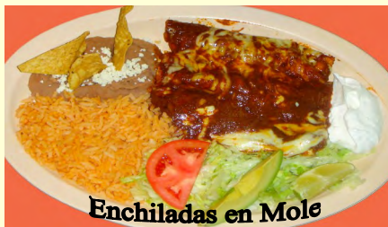
Enchiladas en Mole

ENCHILADAS SUIZAS (3).....$12.99 Three rolled corn tortillas stuffed with chicken, cheese or steak, smothered with melted cheese & our delicious "tomato sauce", served with beans, rice & salad.