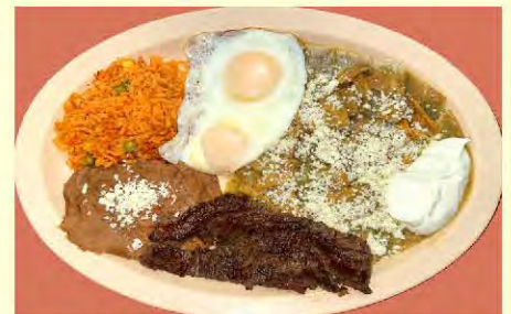
Chilaquiles Verdes con Carne

Tamales desayuno $9.99 Two tamales served with salsa suiza, stripes of sour cream, rice and beans.