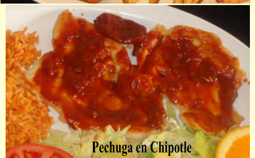
Pechuga en Chipotle