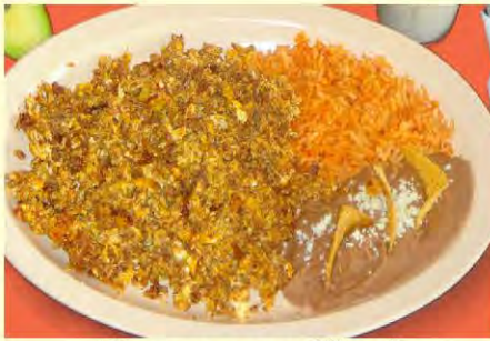
Huevos con Chorizo

Se sirven con arroz, frijoles y tortillas Served with rice, beans and tortillas